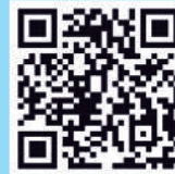
Zone by the Park, Lakshmi Mills, Coimbatore