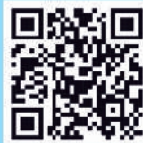
Jade Residency, Peelamedu, Coimbatore