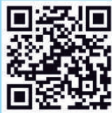
Jenneys Residency, Avinashi Road, Coimbatore